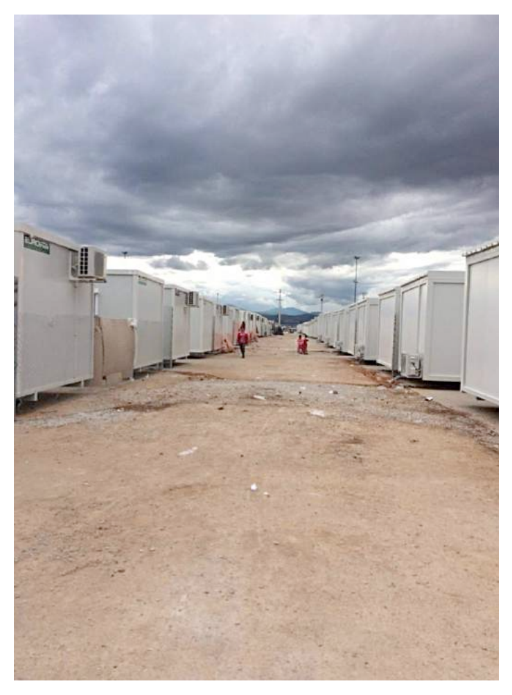
Picture 18: Skaramangas camp is the newest among around Athens. Most of the residents got transferred there from Piraeus port.

Later the family stayed in Kurdistan (in Duhok and Zaho) for 1.5 years. Then the teenager came to Greece via Turkey, together with his mother and his three younger brothers and sisters. The father had already reached Germany in December 2015, where he remains until now as an asylum seeker. "We came to Greece on March 19. We arrived on the island of Kastelorizo and we staved there for ten days. Then my son became sick and they transported him by plane to a hospital in Rhodes. We followed him there and stayed for four days on the island. We were telling everybody about my son's problem but nobody helped. On April 3 we arrived in Piraeus. Since then we have been here, living in a small tent. We want to go to the camp in Skaramangas. Every day we ask: "When we can go?" and they say tomorrow. They take other people but not us. We don't know why. My son had to go three times to the hospital since we have been in Piraeus: the first time for one day, the second time for two days and the third time for seven days. And now he is still in hospital. I don't know what kind of medicine he takes. We only heard about the possibility of family reunification recently through RSPA."