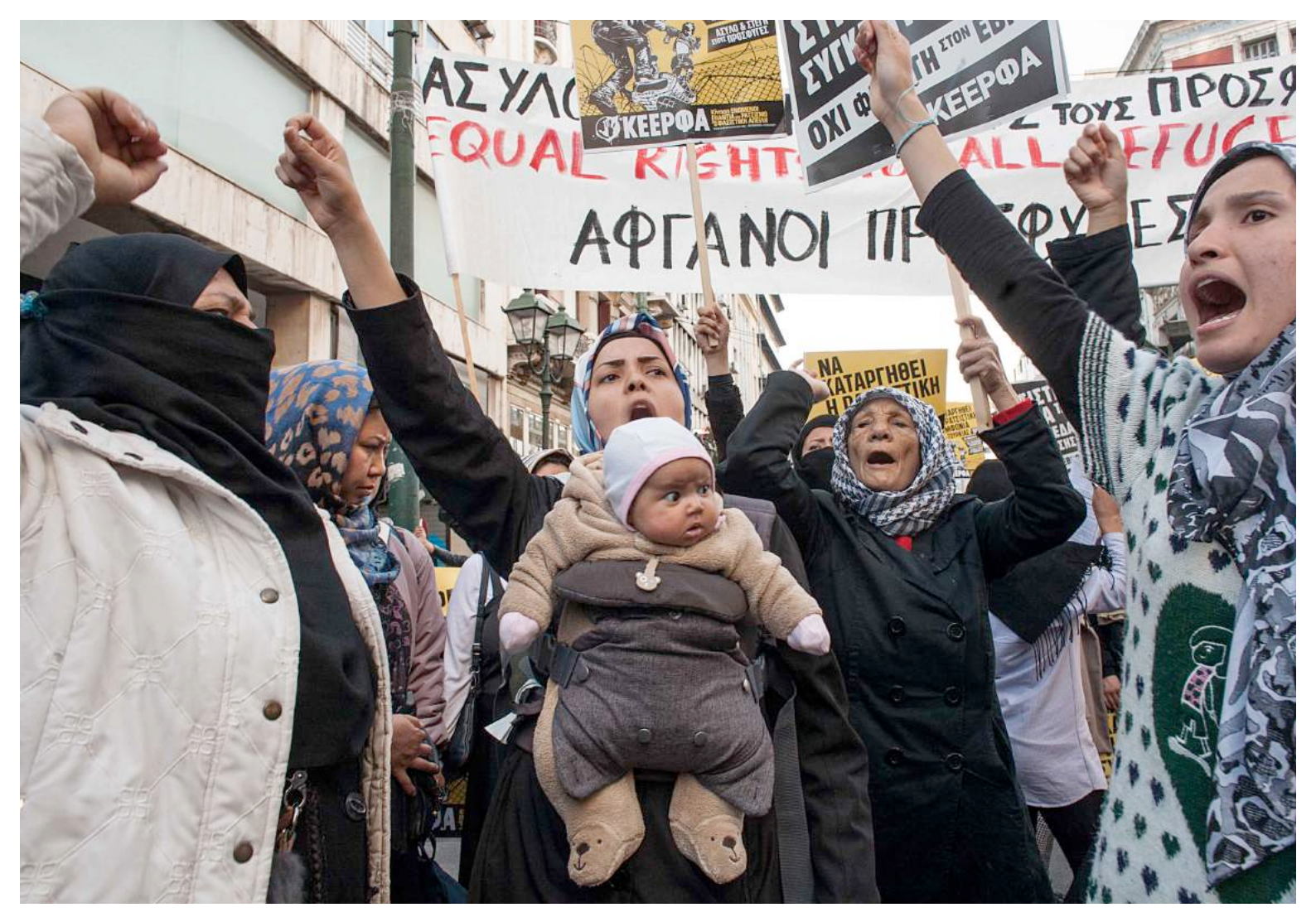
Picture 8: Afghan women demonstrate in Athens again a life in limbo with borders closed and expired papers. Among the protestors are many children - even newborns.

Even in very vulnerable cases, where refugees seek humanitarian or family reunification visas from the German Embassy to reunite with an immediate family member with refugee status in Germany, rejections are now based on very strict preconditions. The Ecumenical Refugee Program supported a case of shipwreck survivors. The couple involved, who were in Greece, had an underage son in Germany who had acquired refugee status there. The woman was eight months pregnant and they had lost a baby in the shipwreck. After two months' processing and a pre-approval visa from the migration authority in Cottbus, the visa section in the Embassy refused to give the family a reunification visa because the couple had not been able to have their papers legalised in the embassy in Ankara or Beirut. According to Efthalia Pappa: 'The German Embassy should apply more flexible and humanitarian criteria to facilitate the family reunification with family members that live in Germany.'"