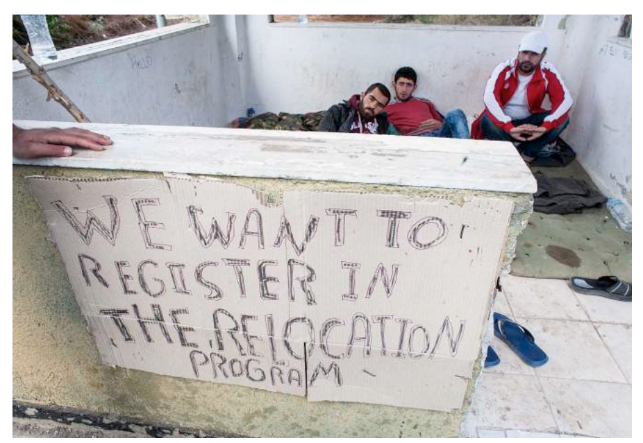
Picture 1: Syrians in Ritsona camp were six days on hunger strike for their right to access asylum procedures and relocation.

According to the IOM<sup>4</sup>, "after EU-Turkey the agreement, nationalities certain have indeed increased their interest in returning to their home country. Monthly registration and return data for the currently implemented Assisted Voluntary Return programme clearly demonstrate the effect of the current situation at the borders. In January, we had close to zero departures by Afghanis and Iraqis, but in April Afghanis are the main nationals returning to their country of origin, followed by Iragis [...]"