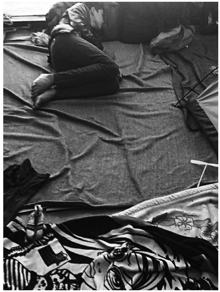
Picture 10: Sleeping with another 1,499 refugees in Elliniko camp.