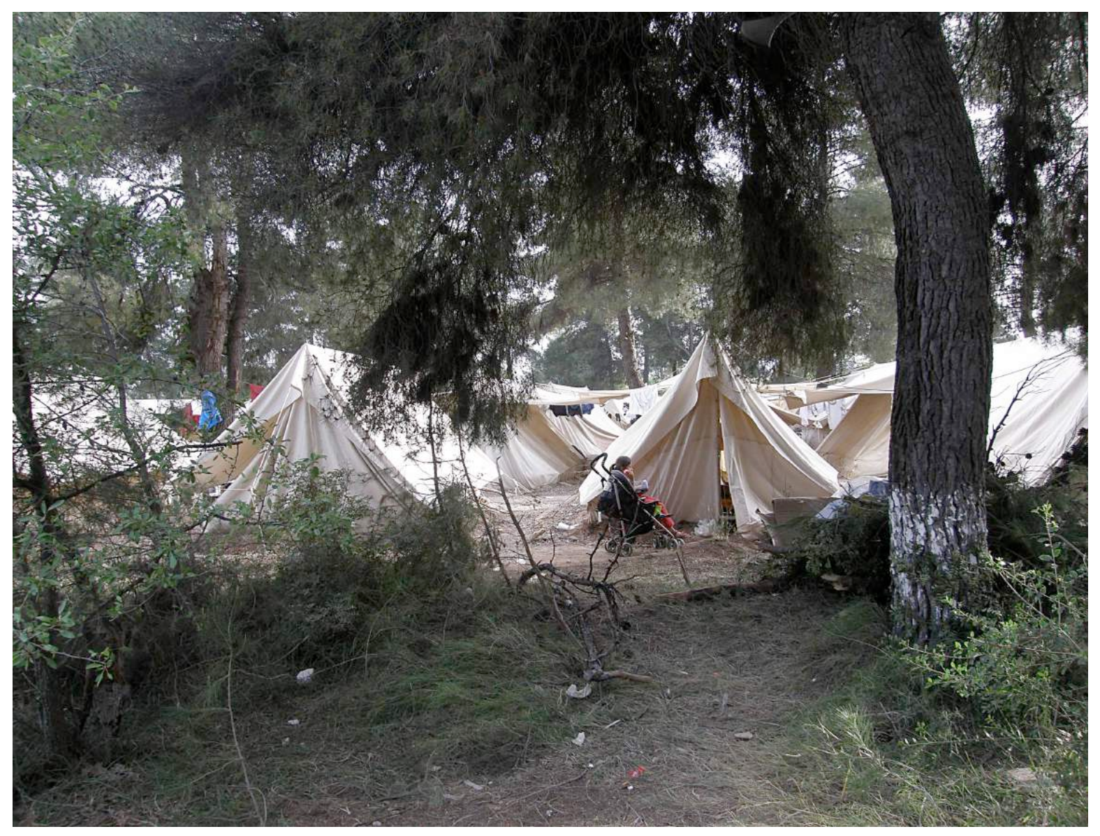
Picture 16: Living in the 'jungle' camp Ritsona far from civilization, hospitals and public transportation.

Our plan was to take the overland route to Northern Europe, but when we arrived at Piraeus, we didn't go to the border of FYROM because they told us the border had been closed. We stayed for some days in the port, in the open, without any shelter. Then some people brought us a tent to sleep in. Later EASO came and told us to register for relocation. I was with my brother. He didn't want us to register because he hoped that the borders would reopen. I wanted to register with EASO but he didn't let me. A volunteer took me to the hospital in order to have me examined. My situation there was very bad. I had a lot of pain in my waist.