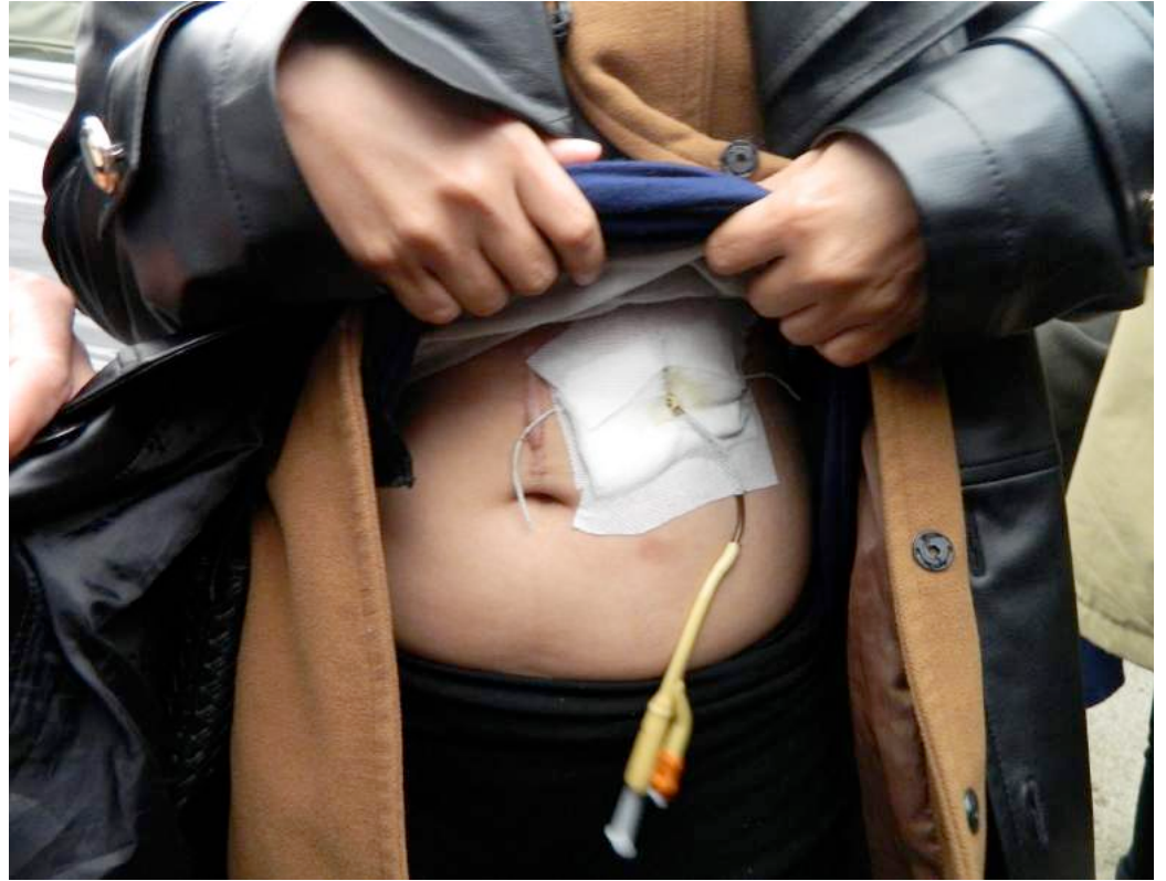
Picture 3: Z. has to stay in Schisto in a tent while she is in a very difficult health condition.

complained that the medication required was not available free of charge, and that they had to leave hospitals by their own means, which in many cases, where no monev was available to pay for a taxi or other kinds of public transport, meant walking back to the camps no matter how far away they were.