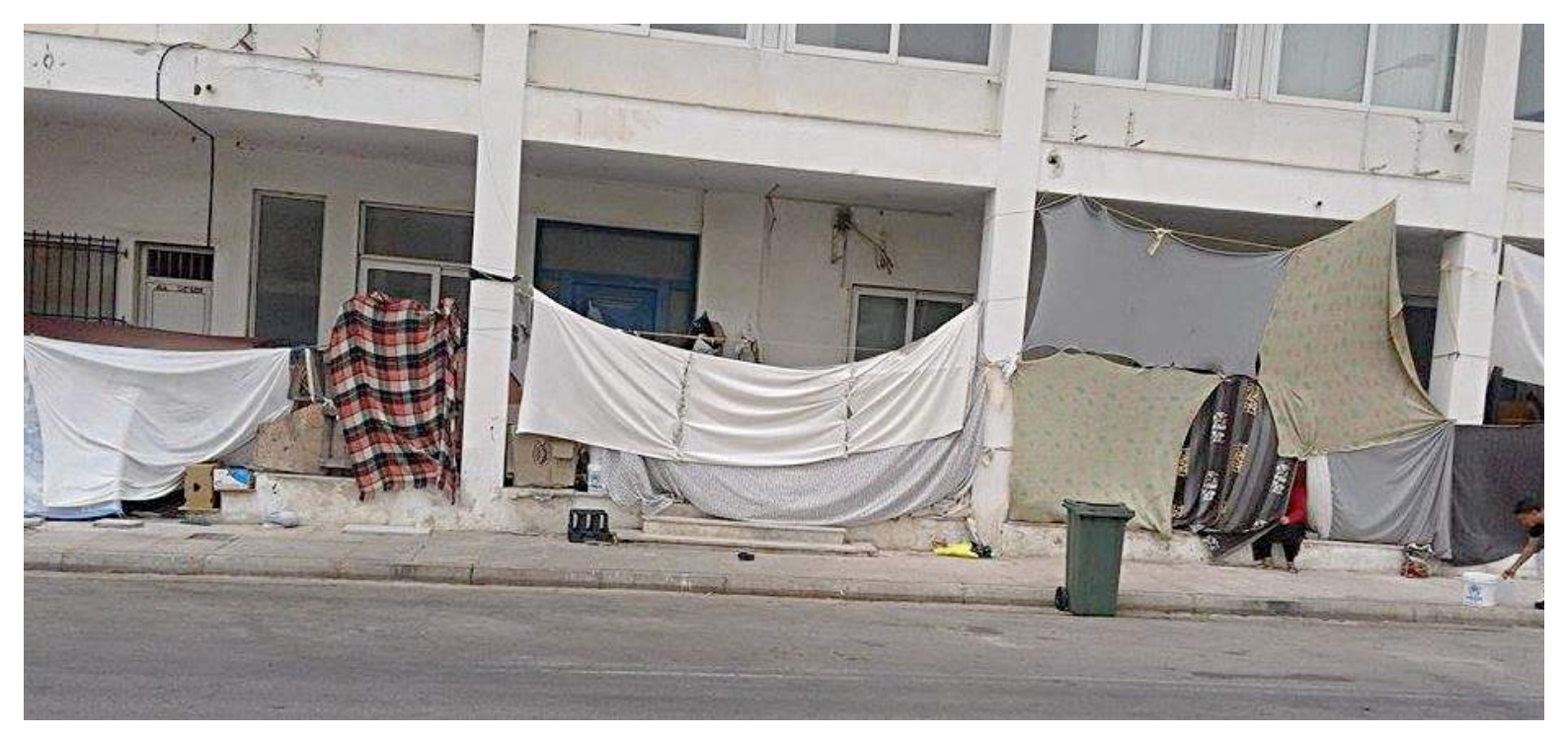
Picture 9: Dozens of tents separated by mere beddings were set up by refugees outside of Elliniko in March and April. them housing a total of approx. 900 refuges.

The Asylum Campaign, run by most of the mayor refugee supporting Greek NGOs and solidarity groups amongst others, in a recent <u>open letter</u> (May 19) demanded the immediate complete registration of all asylum claims and a fair procedure while criticising the planned pre-registration exercise as no solution. Only the decisive and effective enforcement of the Asylum Service with specialized personnel and a respective infrastructure in order to respond adequately to the increased needs, coupled with a radical change of the Office's orientation, focussing by priority on providing effective protection to refugees, would render a sustainable approach possible that would avoid a new backlog creation.