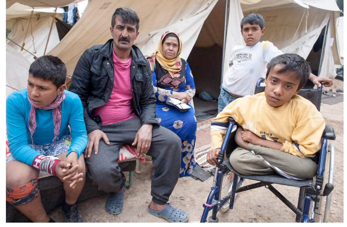
Picture 15: Ritsona camp has also pebble ground.

understands why they react aggressively sometimes. We had one case like that in the harbour. It was a small child who was verv aggressive. But who knows what experience this mentally disabled girl gone had through?"