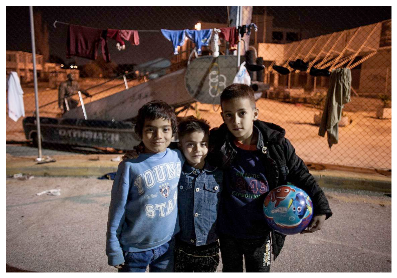
Picture 4: Playing outside of Elliniko at the former airport arrival.